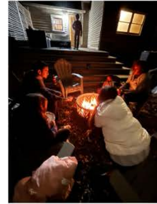
Smoers around the firepit