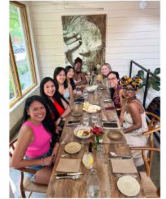
Birthday Brunch with friends