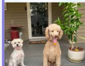
Me and my sister meeting up for breakfast (below)