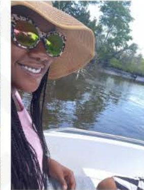
Summertime on my dad's boat (left)