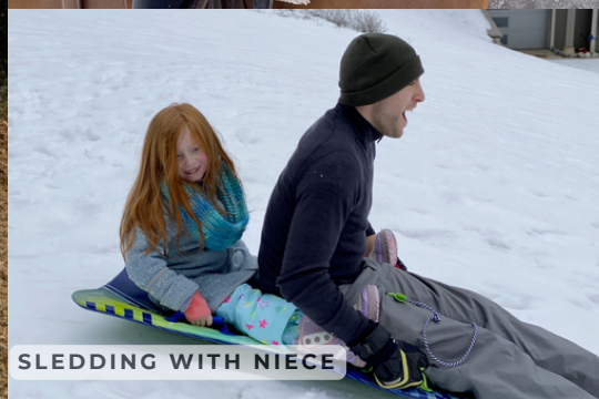
SLEDDING WITH NIECE