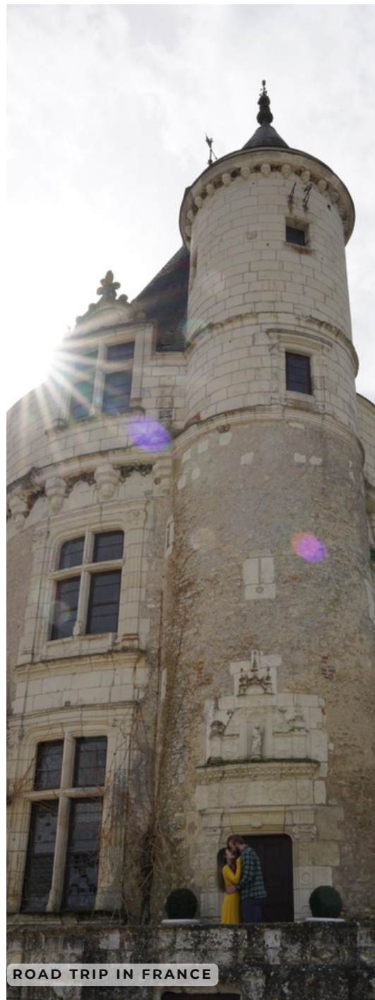
ROAD TRIP IN FRANCE