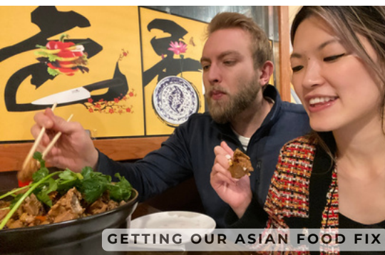
GETTING OUR ASIAN FOOD FIX