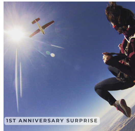
1ST ANNIVERSARY SURPRISE