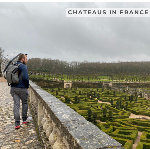
CHATEAUS IN FRANCE