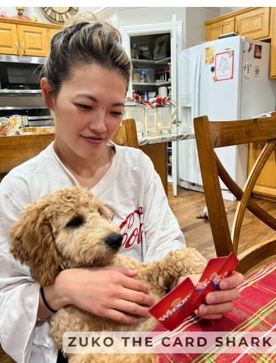
ZUKO THE CARD SHARK