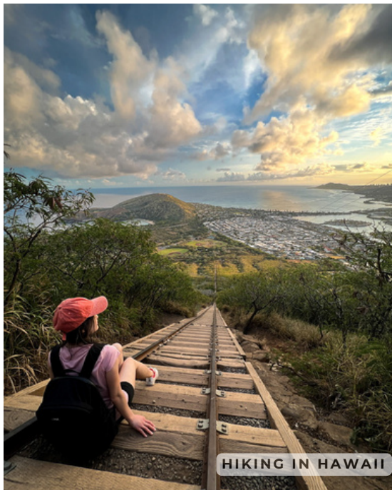
HIKING IN HAWAII