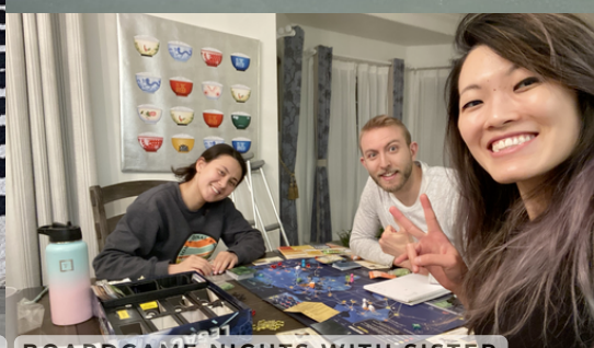
BOARDGAME NIGHTS WITH SISTER