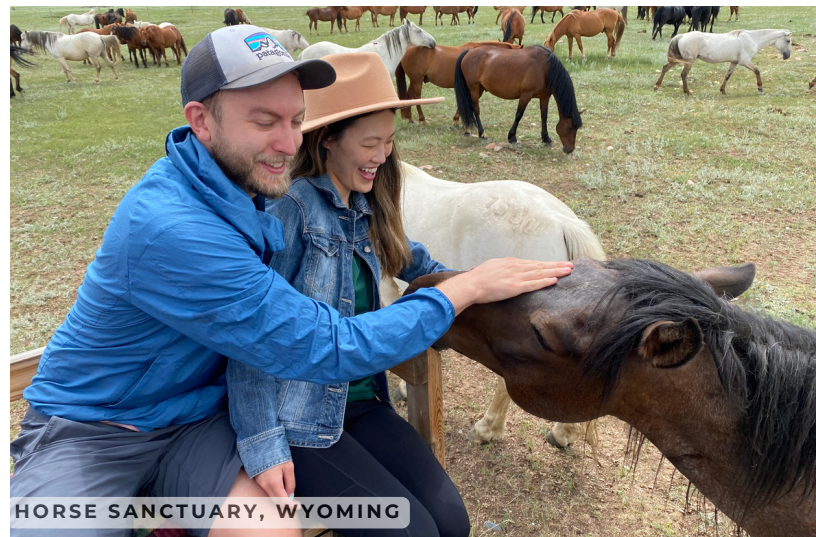
HORSE SANCTUARY, WYOMING