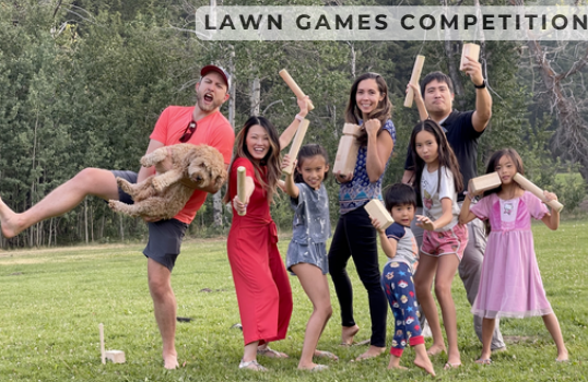
LAWN GAMES COMPETITION