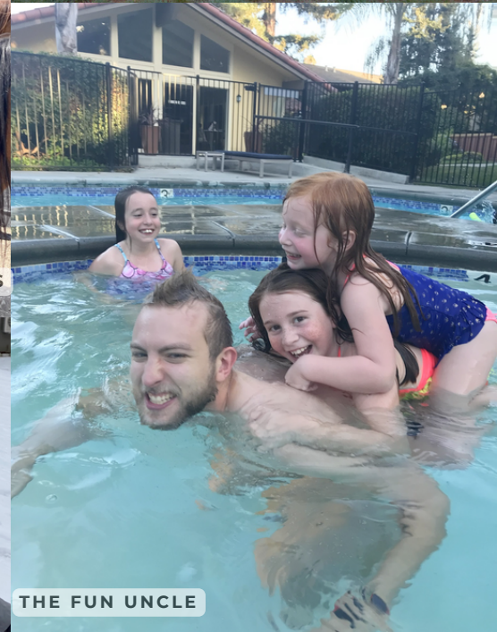
THE FUN UNCLE