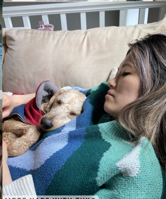
MORE NAPS WITH ZUKO