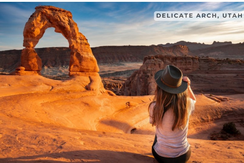
DELICATE ARCH, UTAH