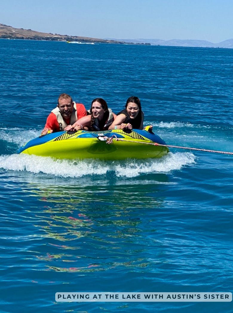
PLAYING AT THE LAKE WITH AUSTIN'S SISTER