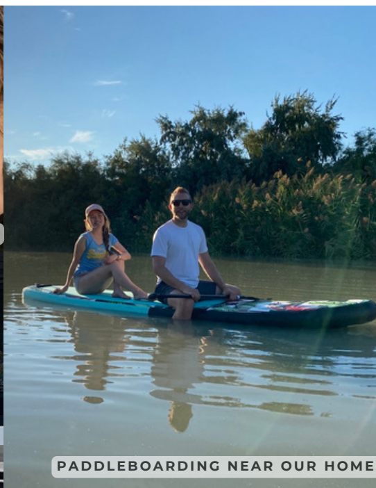
PADDLEBOARDING NEAR OUR HOME