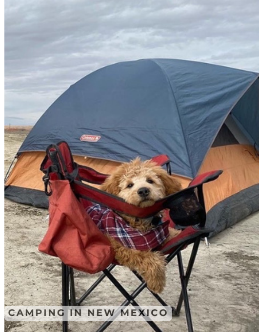
CAMPING IN NEW MEXICO