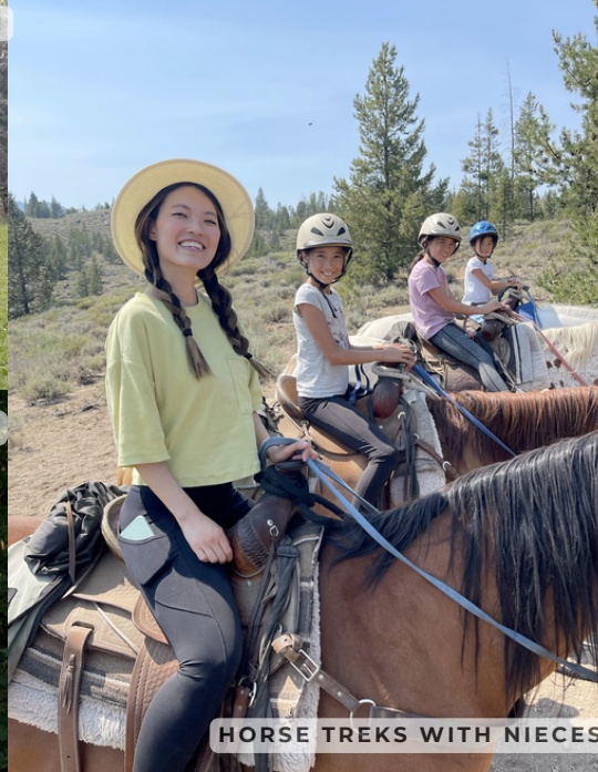
HORSE TREKS WITH NIECES