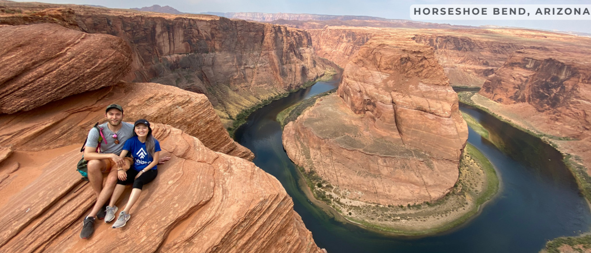
HORSESHOE BEND, ARIZONA