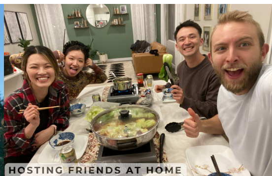
HOSTING FRIENDS AT HOME