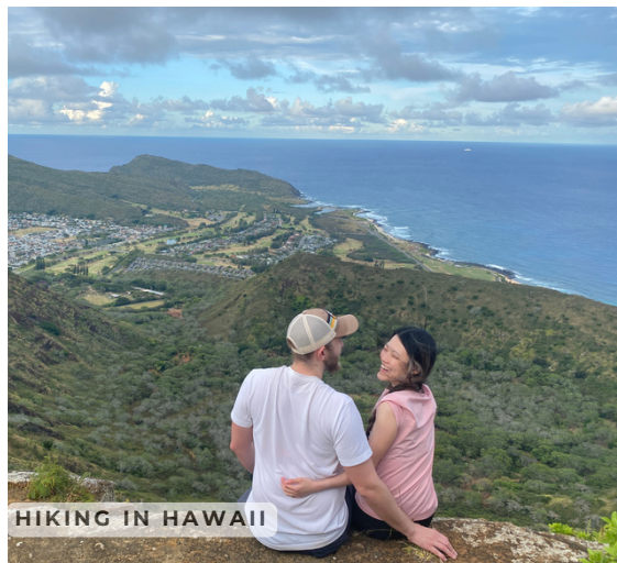
HIKING IN HAWAII