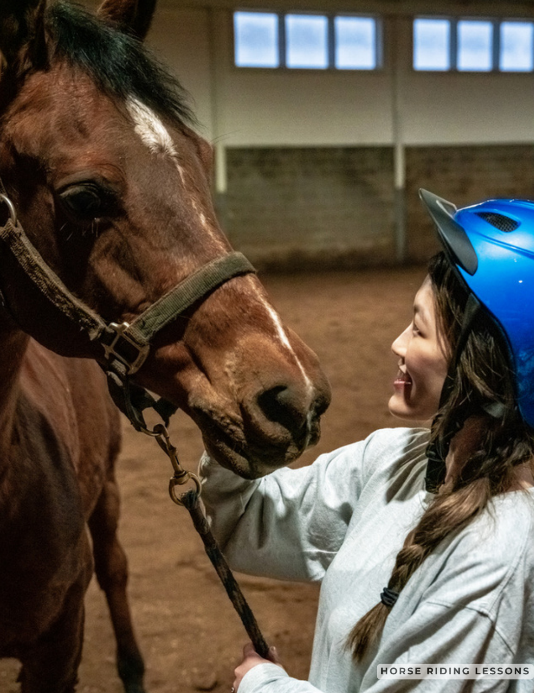
HORSE RIDING LESSONS