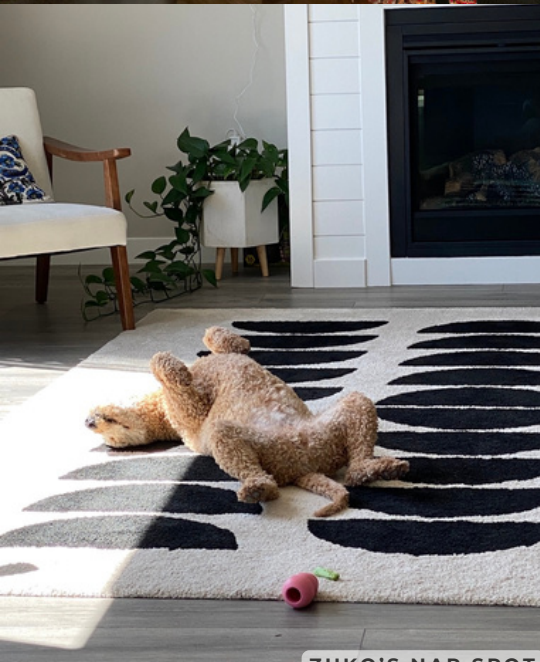
ZUKO'S NAP SPOT