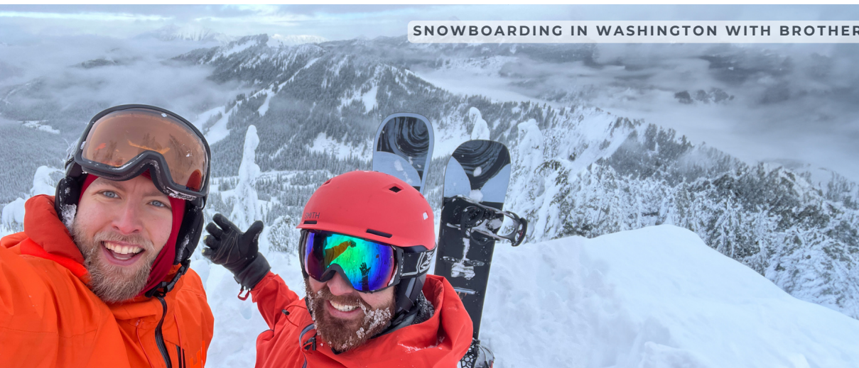
SNOWBOARDING IN WASHINGTON WITH BROTHER