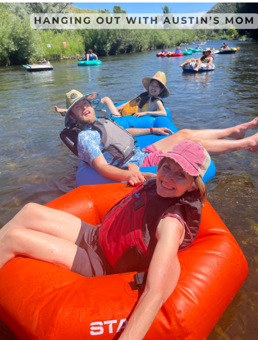
HANGING OUT WITH AUSTIN'S MOM