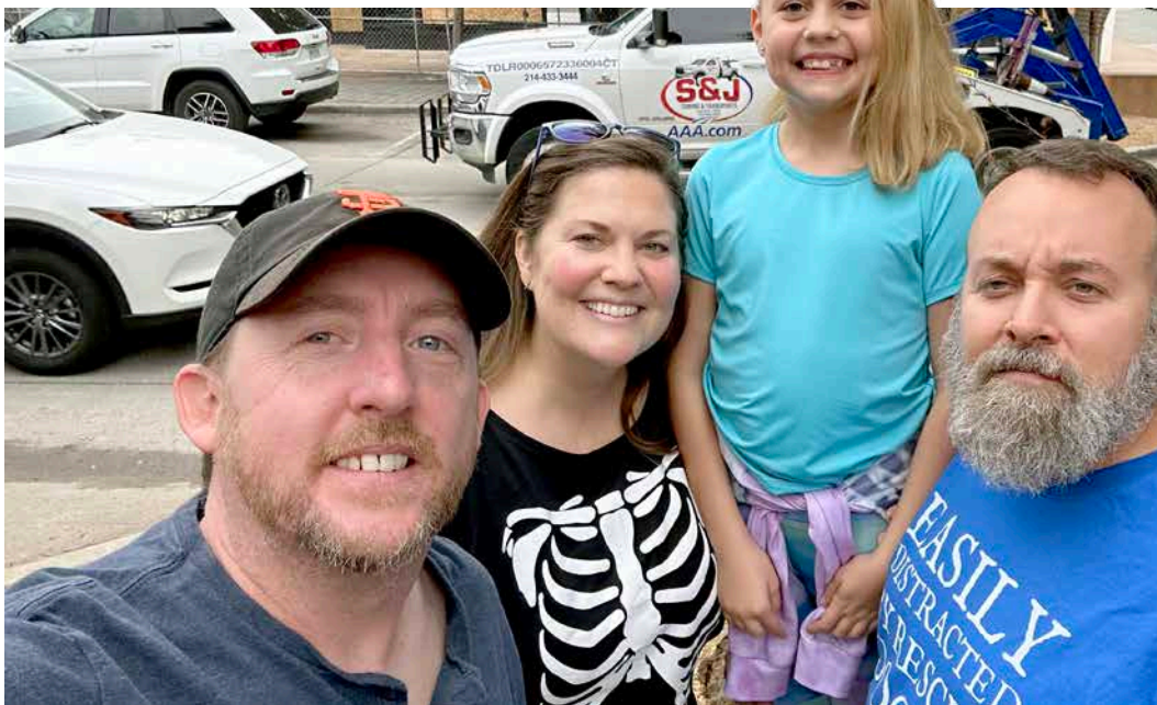
VISITING CLOSE FRIENDS IN DALLAS FOR HALLOWEEN