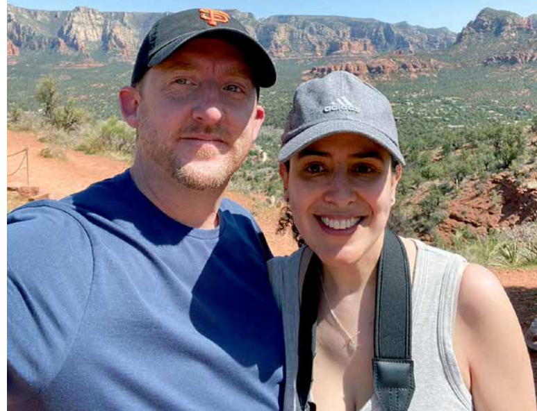
WE LOVE TO HIKE AND EXPLORE THE OUTDOORS