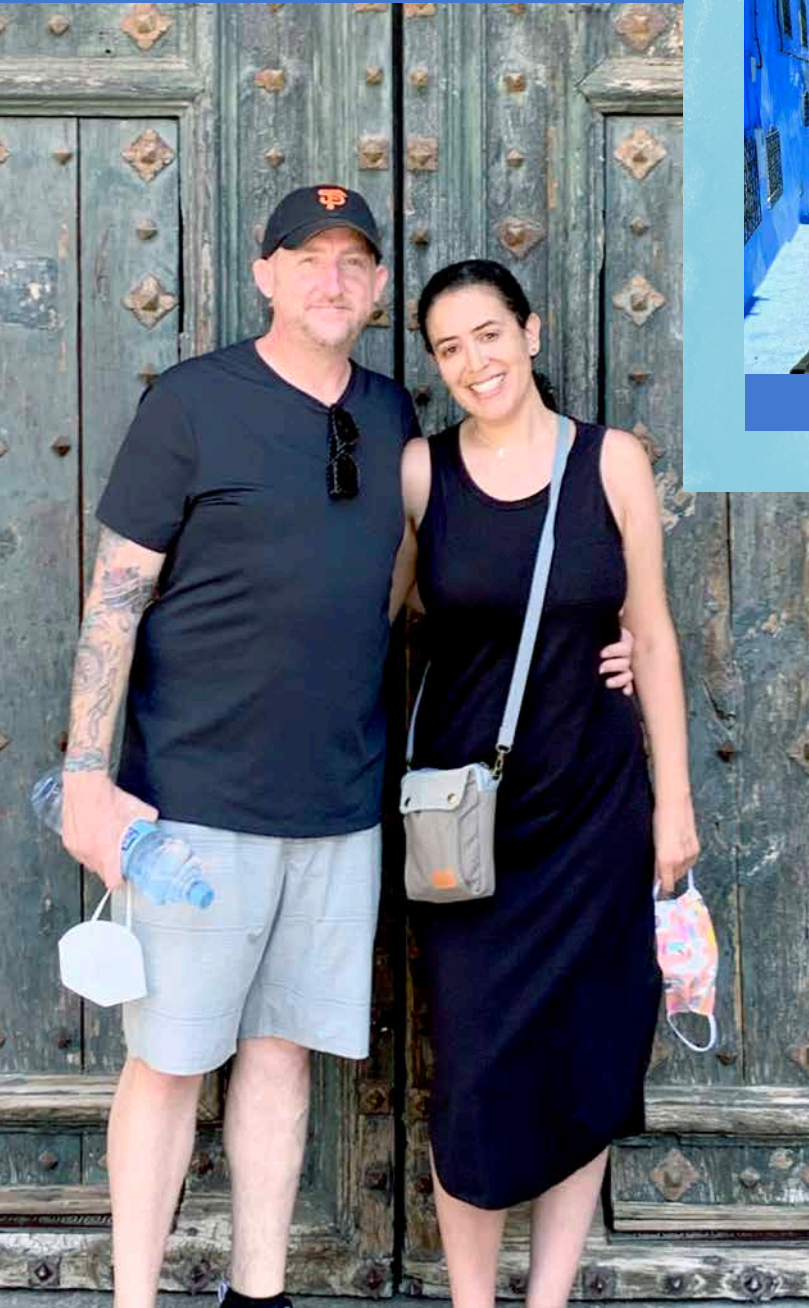
WE LOVED VISITING GIRONA, SPAIN

Gordon not only found Robin so interesting, but even more beautiful. We share the same values of kindness to others, appreciating different cultures, a love of travel, music, food, and pets. We even have our own secret handshake!