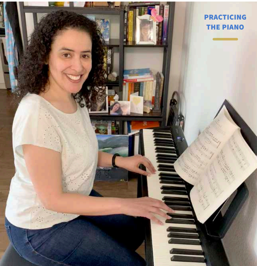
PRACTICING THE PIANO