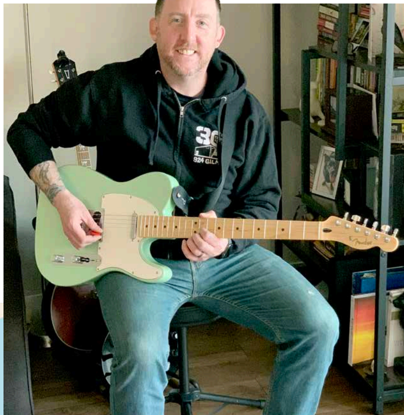
PRACTICING THE GUITAR