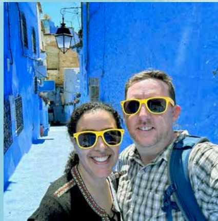
HAVING FUN IN MOROCCO!