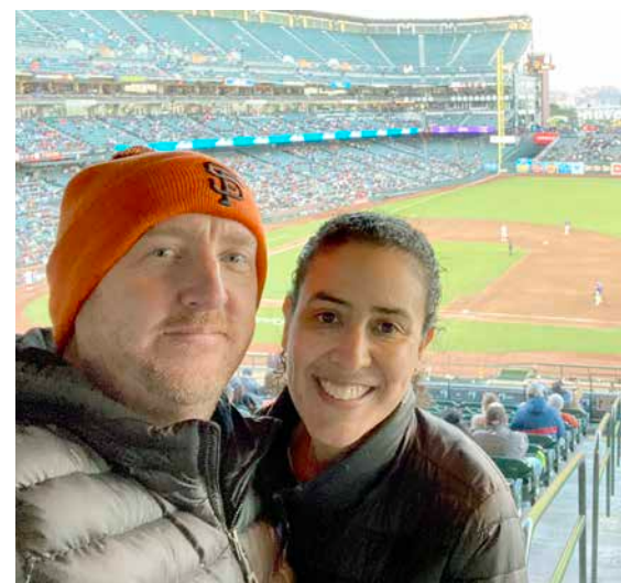
CATCHING A BASEBALL GAME