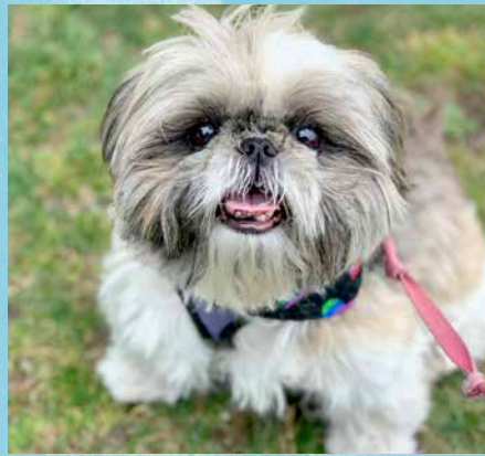
CHECKING OUT THE LOCAL FOOD TRUCK SCENE WITH OUR DOG RILEY