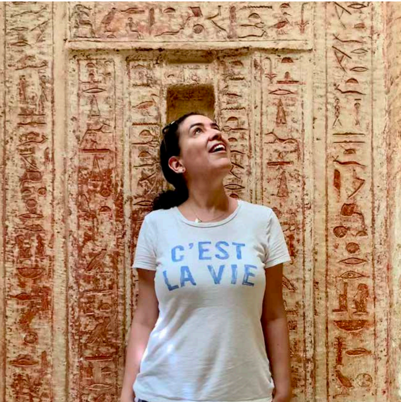
IN AWE OF A TEMPLE IN EGYPT