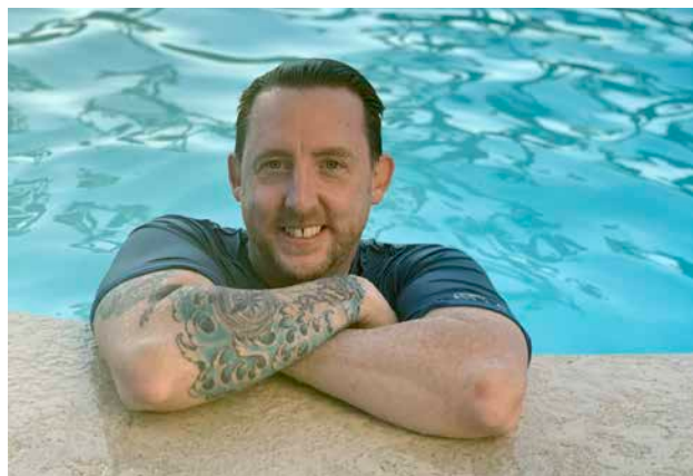
PLAYING IN THE POOL