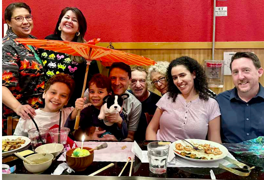
THERE ARE ALWAYS LAUGHS WITH FAMILY