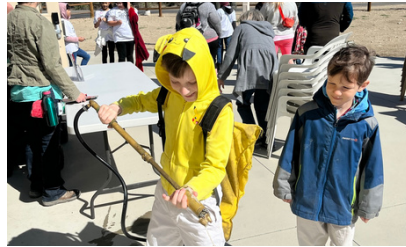
Cousins at the Zoo